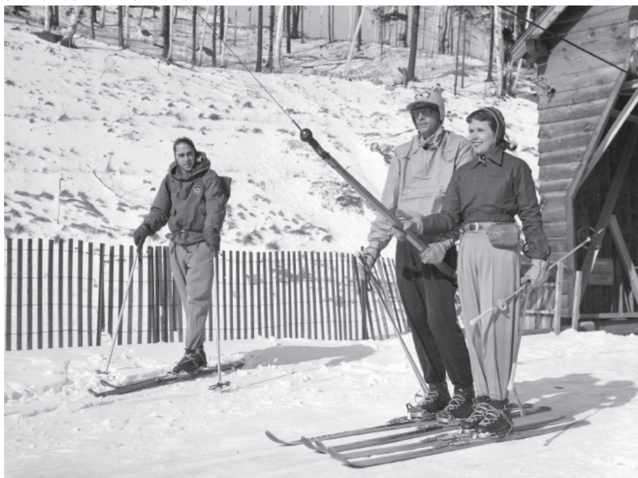
The Roebling-Constam T-bar had a length of 3,300 feet with a vertical rise of 900 feet. Skiers could exit at several spots along the trails. The T-bar was removed from the defunct ski area in 1967.